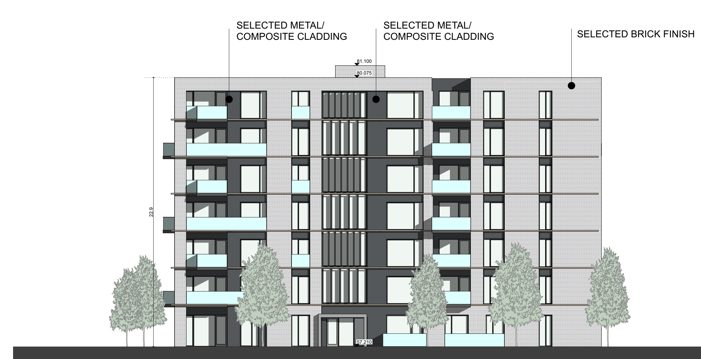
Elevation G-G SCALE: 1:200